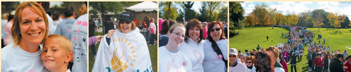
Some of Sun Life's Run for the Cure participants from event locations across Canada (L to R): Vancouver, Toronto, Pickering, Montreal.

Sun Life's 2010 Run for the Cure volunteers "picked up the pace" in both numbers of participants and money raised. Since Sun Life began participating as a company in the Run for the Cure, we have had an objective to raise at least $100,000 annually. At the end of our seventh consecutive year, we have surpassed that objective, as the Sun Life team has raised more than $840,000 in seven years. Our 2010 national contingent included 495 Sun Life employees, family members and friends. Encouraged and inspired by their tireless team captains, they ran, rallied and raised money for the cause, and, together with our Company's contribution, raised $120,000 for the work of the Canadian Breast Cancer Foundation.